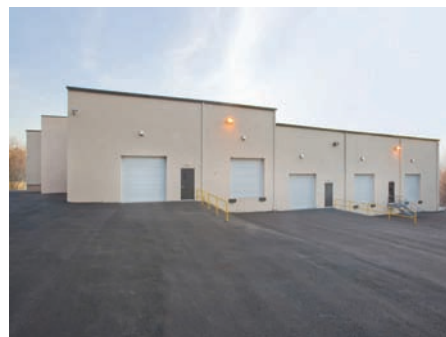
3 Loading docks/2 drive-in doors