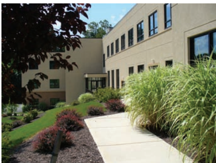
Nice entrances to office spaces