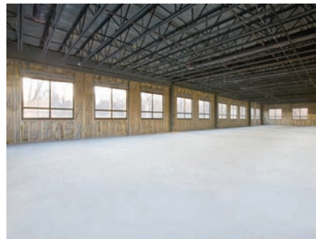
Large open office spaces, great views