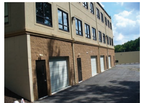
Flex space—garage doors